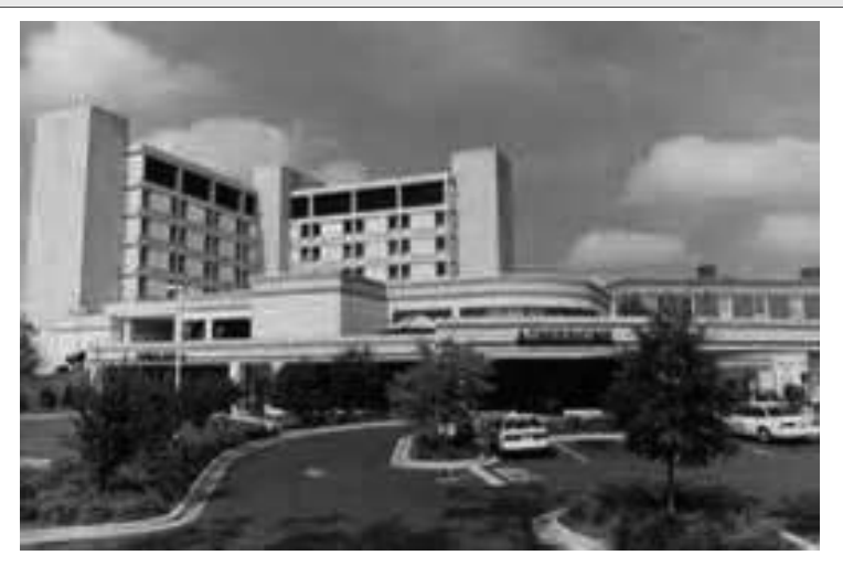
From Charlotte (US-521 South):

Turn right onto West Meeting Street. Go approximately two miles and hospital will be on your right.