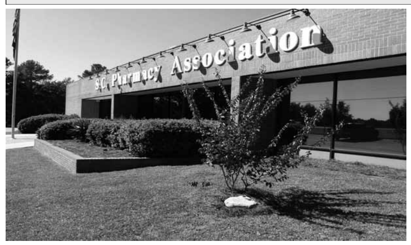
From the Upstate